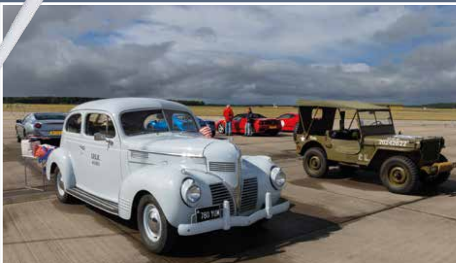
Vehicles old and new

Back on the ground there was lots to entertain young and old alike with the gleaming sports car club vehicles, demonstrations from West Mercia Police, face painting, a digger simulator, archery, inflatables, charity stands, craft stands and a range of food outlets. An evening party with Fish & Chips and music rounded off a memorable day. These events do not just happen, the Project Officer and his team should be congratulated on all their hard work and fully deserve the plaudits for a fantastic event.