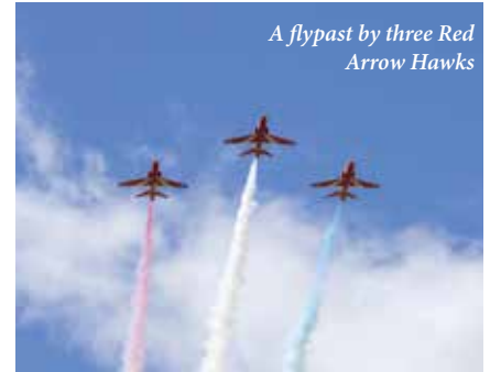
A flypast by three Red Arrow Hawks

In August 1961, the CFS(H) Squadron moved from South Cerney to RAF