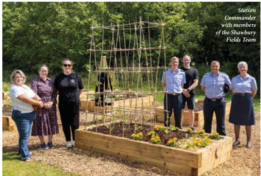
Station Commander with members of the Shawbury Fields Team

Today, the fruits of their labour are on full display as ten raised beds stand proudly on the land, each bursting with a colourful array of fruits, vegetables, and herbs. These beds not only provide fresh, organic produce for the tenants but also serve as an area for reflection and respite for those who tend to them. The impact of the RAF Shawbury community project extends far beyond the boundaries of the base, reaching out to touch the lives of the families who benefit from the bountiful harvest grown on the land. For these families, the project is not just about food - it