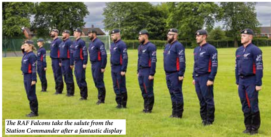
The RAF Falcons take the salute from the Station Commander after a fantastic display

and horse riders on all things which happen at RAF Shawbury and across our low-flying area, the finale of the day was a fantastic display by the RAF Falcons who dropped in at the very limits of their wind envelope!