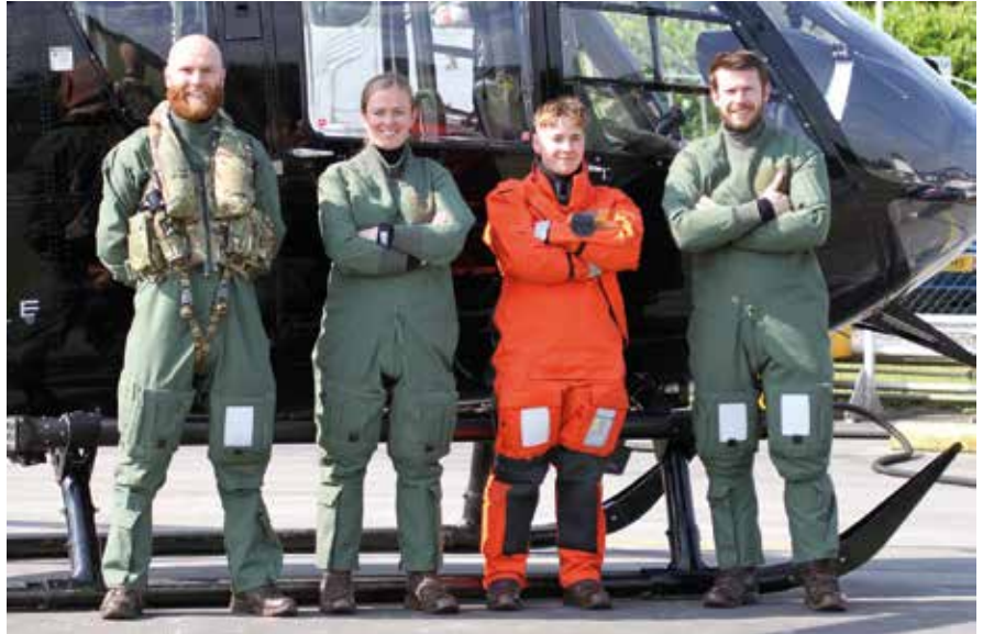
Crew No 1 immediately after crossing the channel and landing at Breda international airport

T ag Der Bundeswehr is the German equivalent to Armed Forces Day, comprising of a collection of events across the country showing off the vast array of vehicles, air systems and equipment of the Bundeswehr to the German public. This year, Holzdorf Air invited 1 FTS to participate in their celebration. German graduates of 1 FTS are now stationed at Holzdorf, awaiting training on their future frontline aircraft types.