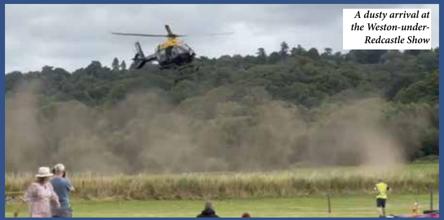
A dusty arrival at the Weston-under-Redcastle Show