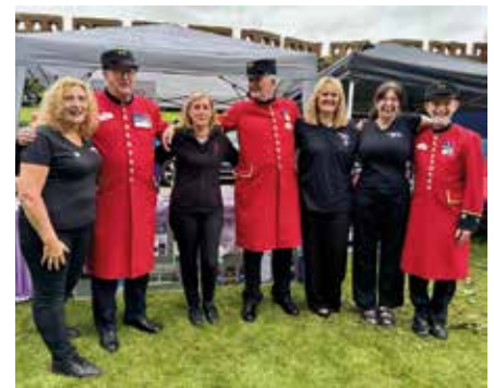
Choir members with Chelsea Pensioners at Armed Force Day

In addition, we performed to over 100 guests at Talbot House (Poperinge), Tyne Cot Cemetery, and the Hooge Crater Museum. It was a very moving and poignant trip and it demonstrated the very best of the Military Wives Choirs ethos of Sing, Share, Support.