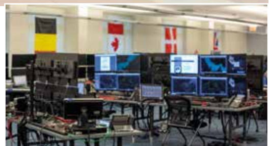
Typical KINGPIN Operations Room

A crew of eight, made up of Air Operations Controllers, both Weapons and Air Traffic Controllers, Air Operations Systems Officers and Air and Space Operations Specialists embed themselves within the coalition