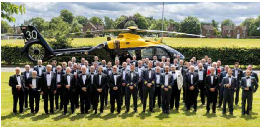
Past and present members of CFS(H) gathered to mark the 70th Anniversary

In 1972, CFS(H) relinquished the basic flying training task to Training Command and became a squadron once again, concerned with the art and science of helicopter instruction. 1974 saw the introduction of the Gazelle, replacing the Sioux and Whirlwind then in use and, two years later, all helicopter training was moved from RAF Tern Hill to RAF Shawbury, forming the CFS(H) that we recognise today.