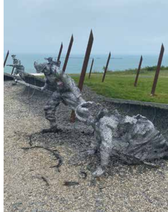
A striking D-Day memorial

As the rain set in, the final visit of the day was to La Point du Hoc. This peninsula lies between Omaha and Utah beaches and was the position of six 155mm German howitzers. The area took a huge bombardment from battleships and destroyers before the vertical 100ft cliffs were assaulted by 260 US Rangers. Only 90 from the original assault remained 2 days later, until relieved by the 29th Division. Prior to the return sea crossing, the team's closing stand was at Pegasus Bridge. Securing and holding the bridges across the Caen canal and river Orne at Bénouville were vital in preventing a German counter offensive from west of the river and putting the Merville battery (in range of Juno and Sword beaches) out of action.