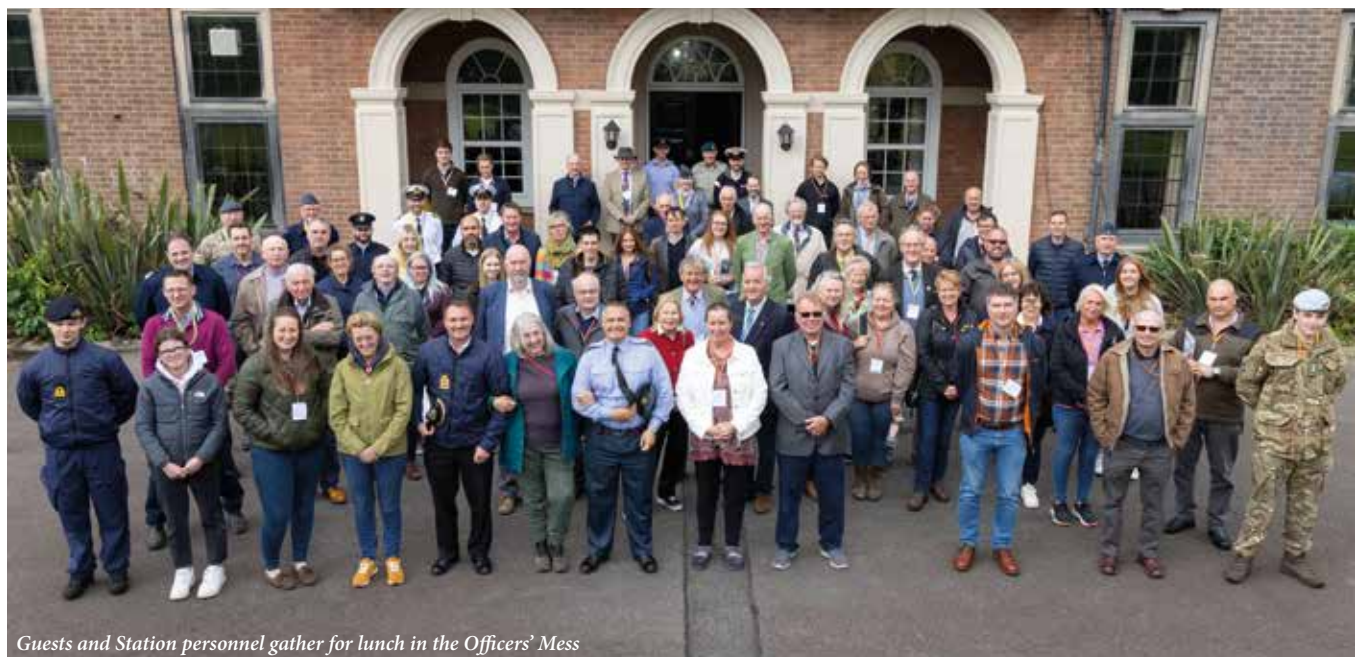
Guests and Station personnel gather for lunch in the Officers' Mess