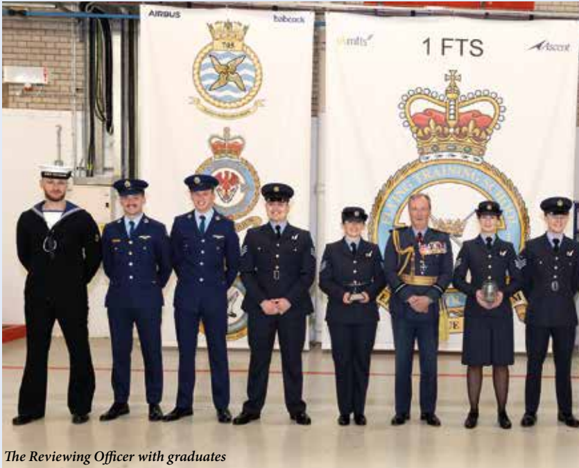
The Reviewing Officer with graduates