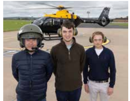
Guests preparing to fly in a Juno helicopter from No 1 Flying Training School