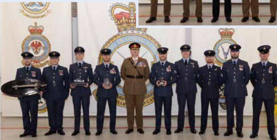
The Reviewing Officer with RAF graduates