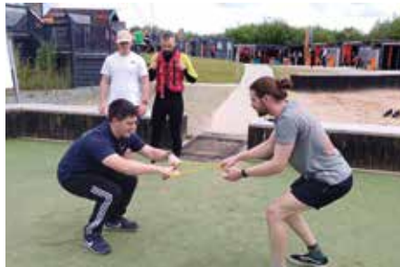
Learning the ropes