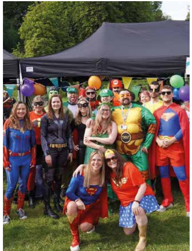
Pictured below: Dragon boat Superheroes

www.doyrms.com | +44 (0) 1304 245073 admissions@doyrms.com