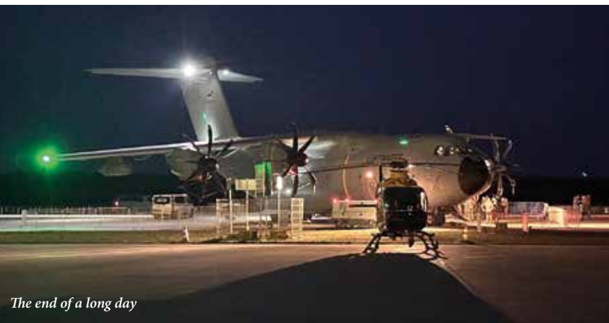
The end of a long day