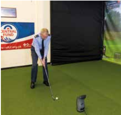
Chief of the Air Staff, Air Chief Marshal Sir Rich Knighton, tries out the Golf Simulator

In June this year, RAF Shawbury had a brand-new Golf Simulator installed which was opened by the Chief of the Air Staff, Air Chief Marshal Sir Rich Knighton.