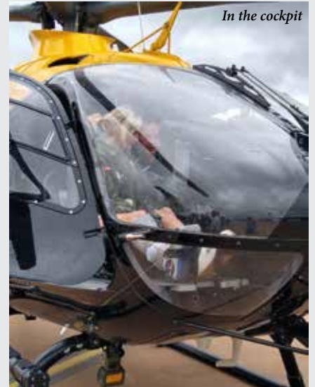
In the cockpit

Ascent was delighted to directly support the RAF's Charitable Trust through this event, which in turn invests across the UK in STEM and outreach.