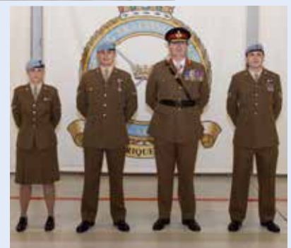
The Reviewing Officer with Army rearcrew graduates