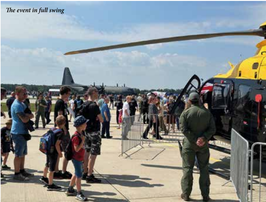
The event in full swing

The exemplary behaviour and enthusiasm of the 1 FTS representatives was hugely appreciated by the Bundeswehr and made for a fantastic trip. Our German colleagues at Helicopter Wing 64 were extremely good hosts. We look forward to Tag De Bundeswehr 2025 to continue the budding relationship 1 FTS now has with its German colleagues.