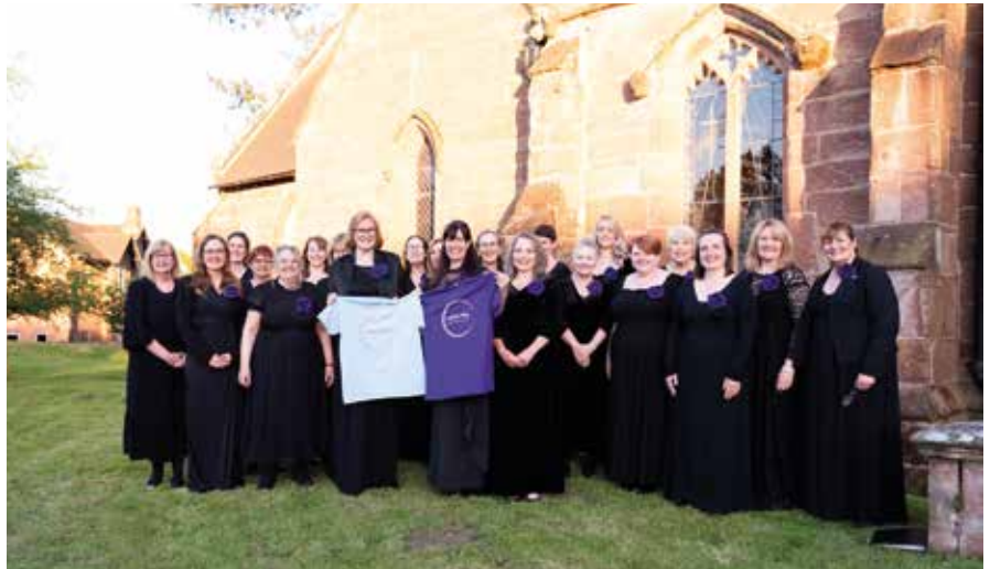
RAF Shawbury Wives Choir with Lottie's Way T-shirts

1500 items were packed into sea boxes in readiness for the next shipment to Kenya.