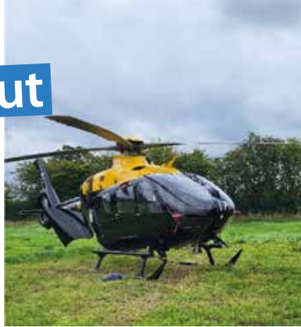
Juno on the ground at Wem Access School