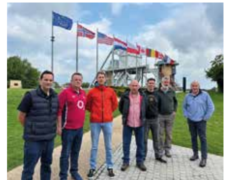
The team at Pegasus Bridge

An audacious aerial raid in the very early hours of 6 June by Major John Howard's D Company, the Oxfordshire & Buckinghamshire Light Infantry, was incredible in its courage and skill. Three Horsa gliders were landed silently, just after midnight, having been released 11 nm and 6000ft out to within 70yds of the objective. Pegasus Bridge was seized and the demolition charges diffused in just 10 minutes. With 600 men of 7th Battalion, the Parachute Regiment landing 30 mins later, the crossings were then held throughout the 6 June, under fierce fighting, until further reinforced from the beach landings.