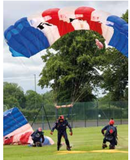
The RAF Falcons Parachute Display Team drop in at the edge of their weather window

After a lunch and lively discussions between Station personnel, landowners