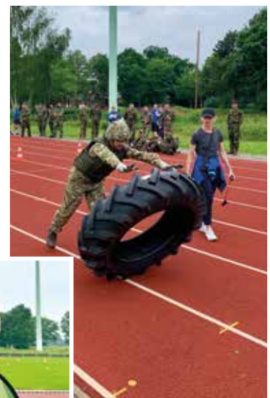
Pictured above: The Tyre Flip event