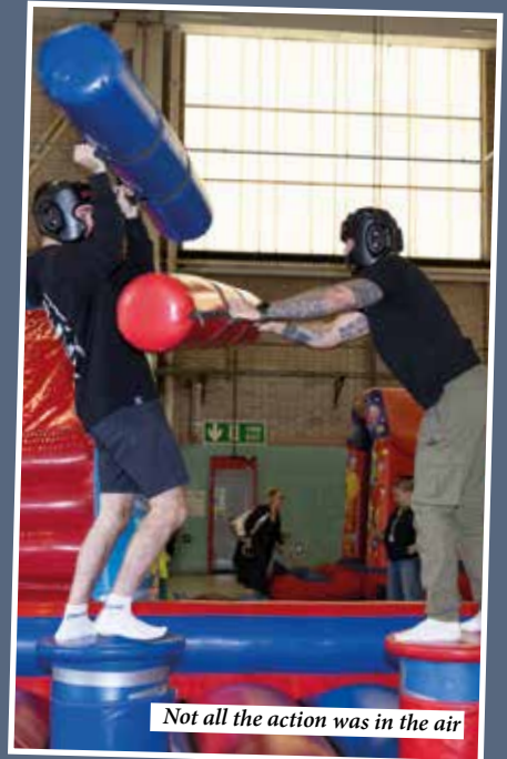
Not all the action was in the air