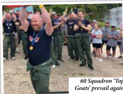
60 Squadron 'Top Goats' prevail again

"Our mission is to provide the highest standards of specialist palliative and specialist end-of-life care through a range of hospice services, 'here and at home', that recognise the individual and their preferences."