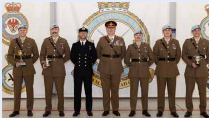
Pictured left: The Reviewing Officer with a Royal Navy and Army pilot graduates