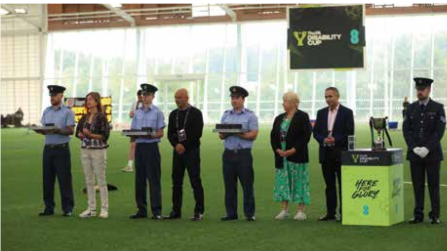
Prize Ceremony line-up

All of volunteers were in awe of the talent that was show at St George's Park and it made them think about skills which could be transferred into their military careers; teamwork, perseverance and overcoming obstacles to achieve aims being just some of these. Although the discipline which was spoken about the most of Blind Football with these players displaying an unbelievably high degree of awareness and skill, all players earned the respect and admiration of the volunteers and left them talking about the amazing experience all the way back to RAF Shawbury.