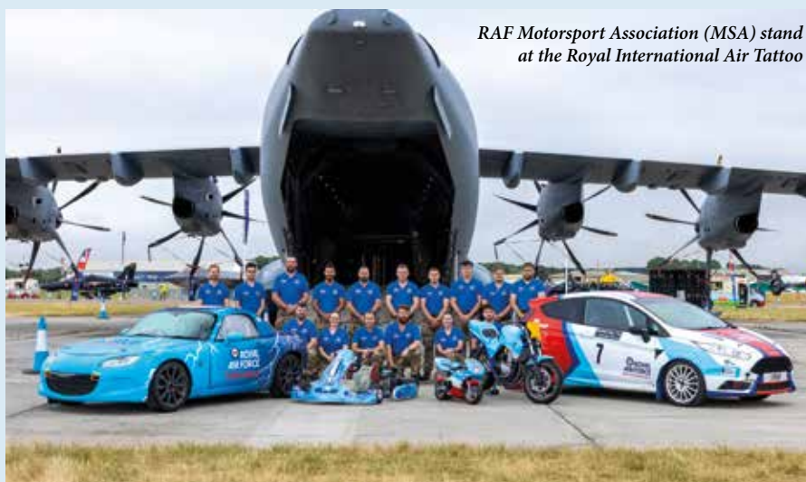
RAF Motorsport Association (MSA) stand at the Royal International Air Tattoo