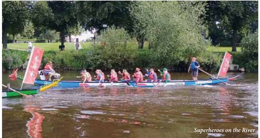
Superheroes on the River

The Shrewsbury annual charity dragon boat race hosted by Severn Hospice saw a splash of colour this year as a team of colleagues, dressed as superheroes, competed in the event. The team, known as the Aquila Avengers, took part in three heats, winning their last race and raising over £3000 for Severn Hospice. Despite not making it to the final, their journey was marked by a remarkable improvement and an undeniable sense of fun and philanthropy.