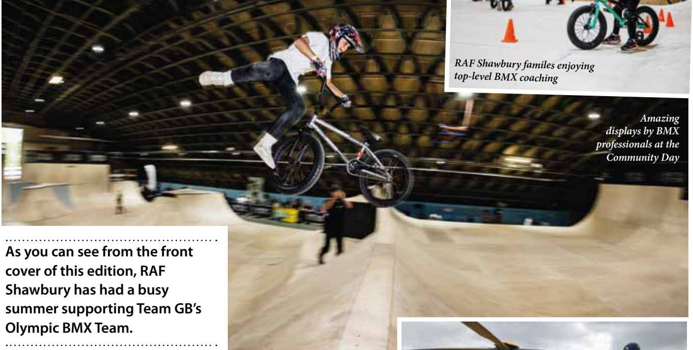
RAF Shawbury families enjoying top-level BMX coaching