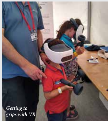
Getting to grips with VR

Hundreds of people had a look around four of the UKMFTS training aircraft – including an RAF Shawbury Juno – during the three-day event, meeting pilots and trainees and finding out more about the work of Ascent and UKMFTS. Also our young visitors had a little taste of what it's like to be a pilot, with an opportunity to try out simulated training flight via VR Headsets.