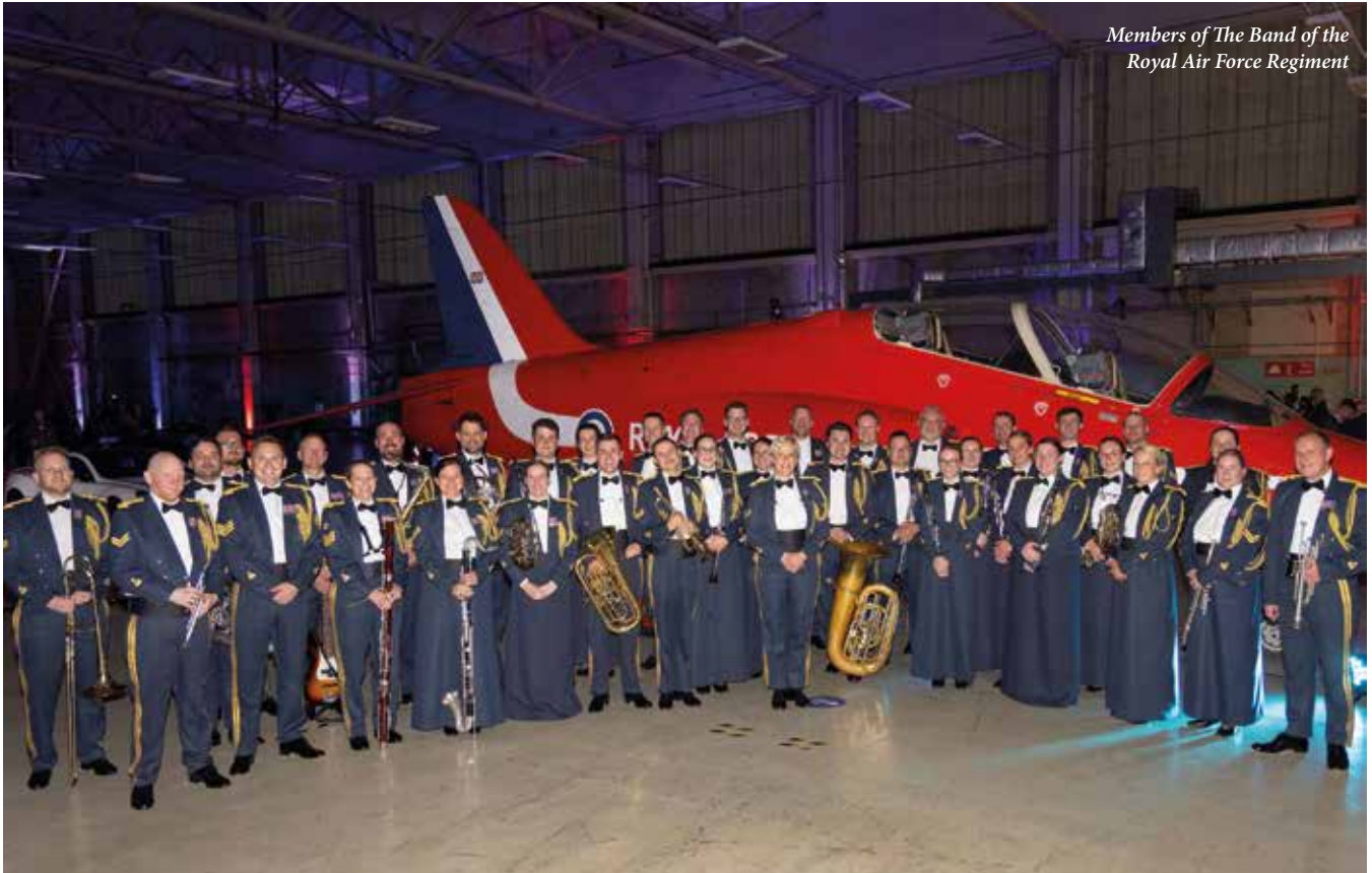
Members of The Band of the Royal Air Force Regiment