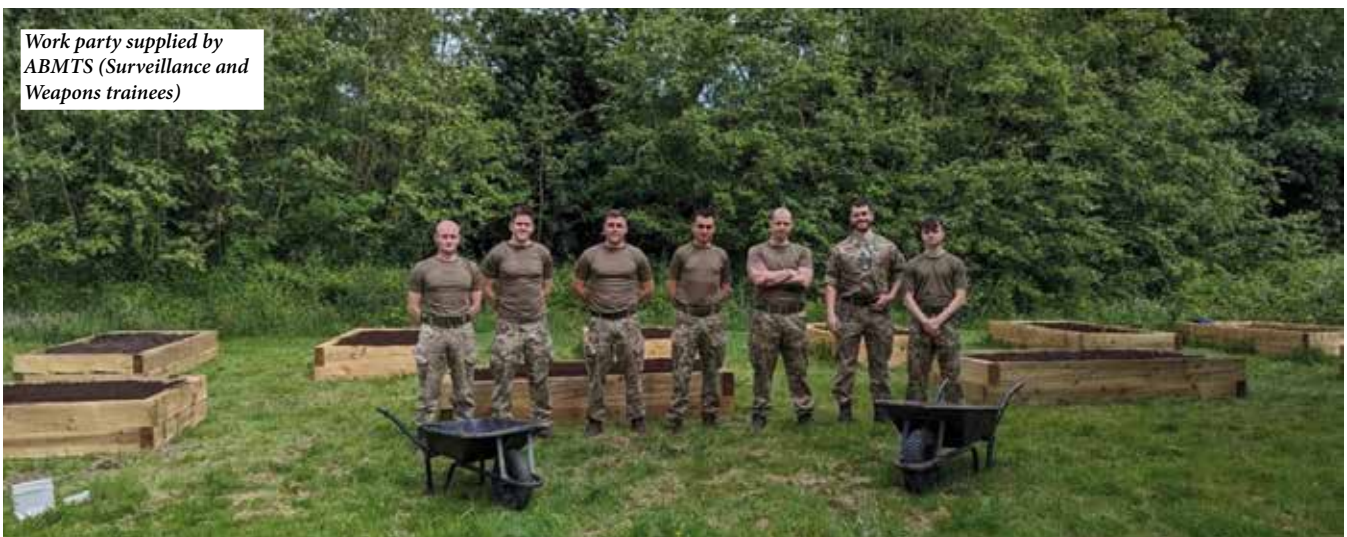
Work party supplied by ABMTS (Surveillance and Weapons trainees)