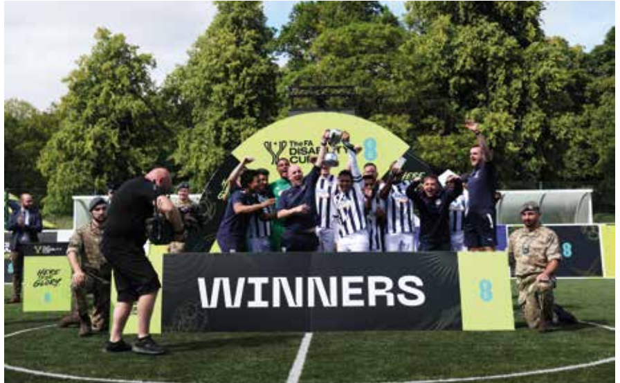
A winning team on and off the field

RAF Boulmer and RAF Wyton. Even an extremely unsociable start time of 0500 didn't faze the volunteers, mainly due to the fact they were all eager to get going and get most of the experience they were being exposed to.