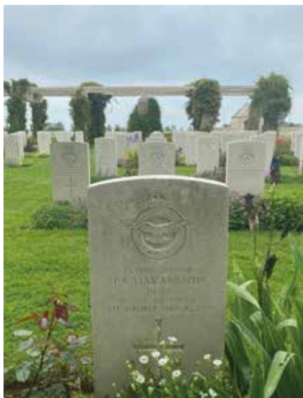
The grave of an RAF pilot

From here, it was a short journey to the coast and the site of the German