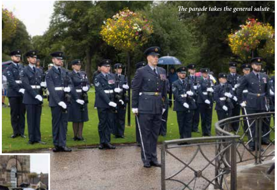
The parade takes the general salute

On Sunday 15 September, Battle of Britain Day, RAF Shawbury marked the 84th anniversary of the Battle of Britain to remember the fallen and service of our forebears.