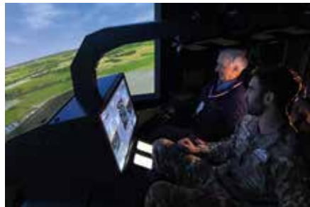
No 1 Flying Training School simulators provide a great demonstration of the challenges of flying a helicopter

and horse riders on all things which happen at RAF Shawbury and across our low-flying area, the finale of the day was a fantastic display by the RAF Falcons who dropped in at the very limits of their wind envelope!