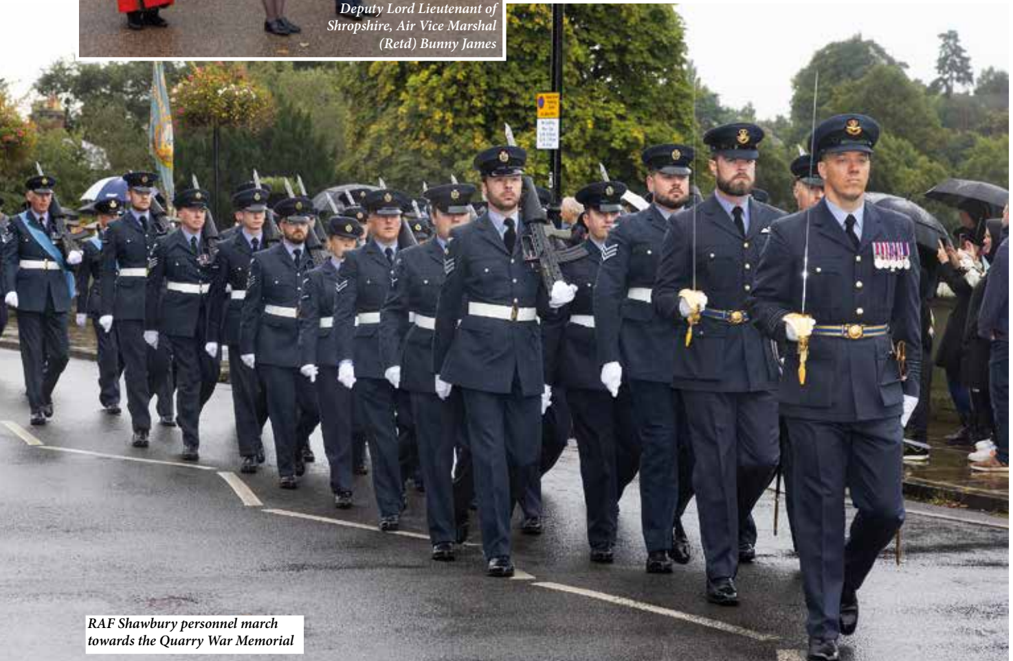
RAF Shawbury personnel march towards the Quarry War Memorial

The Sixty Squadron Standard was paraded, and a service was held at the Quarry War Memorial in Shrewsbury followed by a wreath laying ceremony. Wreaths were laid by the Deputy Lord Lieutenant of Shropshire, High Sheriff of Shropshire, Mayor of Shrewsbury, Station Commander, and Royal Air Forces Association.