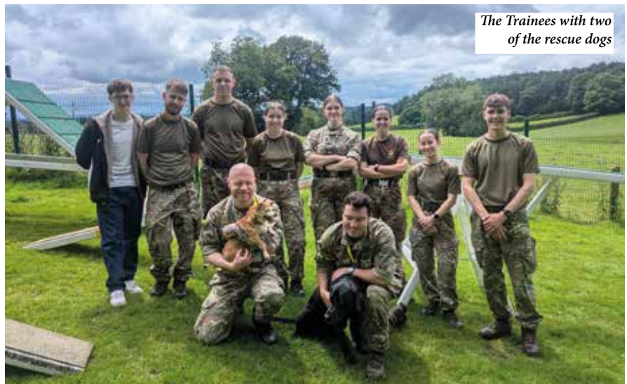
The Trainees with two of the rescue dogs

We arrived on the day and were shown around the kennels and cattery, listening to the history of the family run charity, learning about the different kinds of animals they would look after and the challenges they face. We were then introduced to some of the dogs, and as part of the assistance we were offering, took the dogs out in small groups for a nice long walk. By the time we got the dogs back to the kennels, they were pooped! We then helped to build a new agility course, which will be used for training and rehabilitation, as well as good exercise for the more energetic dogs. We spent the rest of the afternoon painting the shelters, trying to make them look as new and as homely as they could be for the animals. It was a great experience from both sides, and the students thoroughly enjoyed it! Historically, ASOSCs would visit Grinshill regularly, and this visit has paved the way for that to resume.