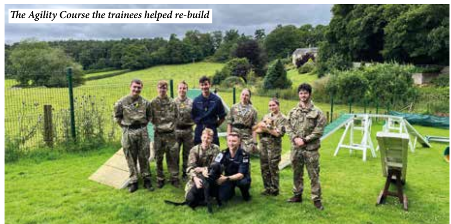
The Agility Course the trainees helped re-build