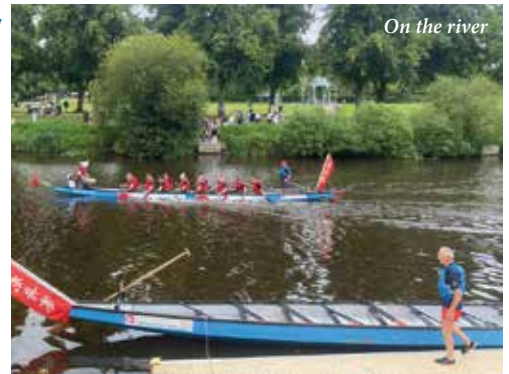
On the river

of Cambridge building in order to raise funds for the charity. On top of this, the team continued to raise money on the day of the race with their team barbeque (kindly facilitated by the finest of German engineering). In total, 60 Squadron raised £4000, and will continue to do so in years to come.