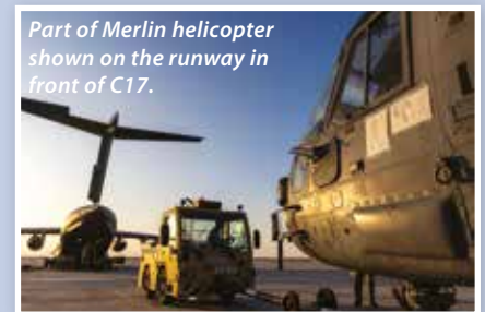
Part of Merlin helicopter shown on the runway in front of C17.