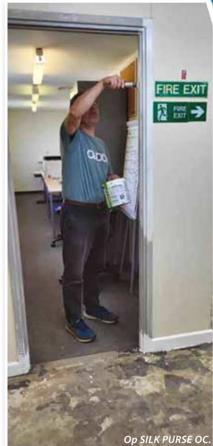
Op SILK PURSE OC.

With a massive effort from the HQ Team, we have now finished the refurbishment of the four Nissan style huts on 501 Squadron and greatly improved the facilities. This has been recognised by our Part Time Reservist Volunteers, who appreciate the vast improvement in their working conditions. Operation SILK PURSE remains in action as we turn our attention to the stores, toilets and the refurbishment of our portacabin.