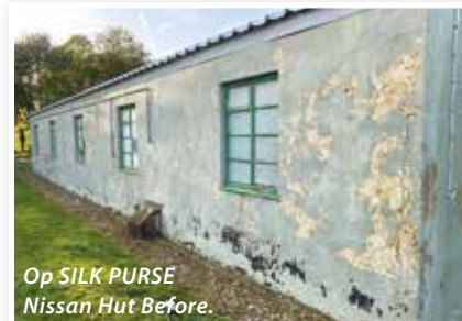
Op SILK PURSE Nissan Hut Before.

The next stage was the upgrade of the HQ offices and these all benefitted from a clean, redecoration and the installation of new carpets. We also managed to secure a community grant from Vinci, who fitted a new kitchen into the HQ Crew room.