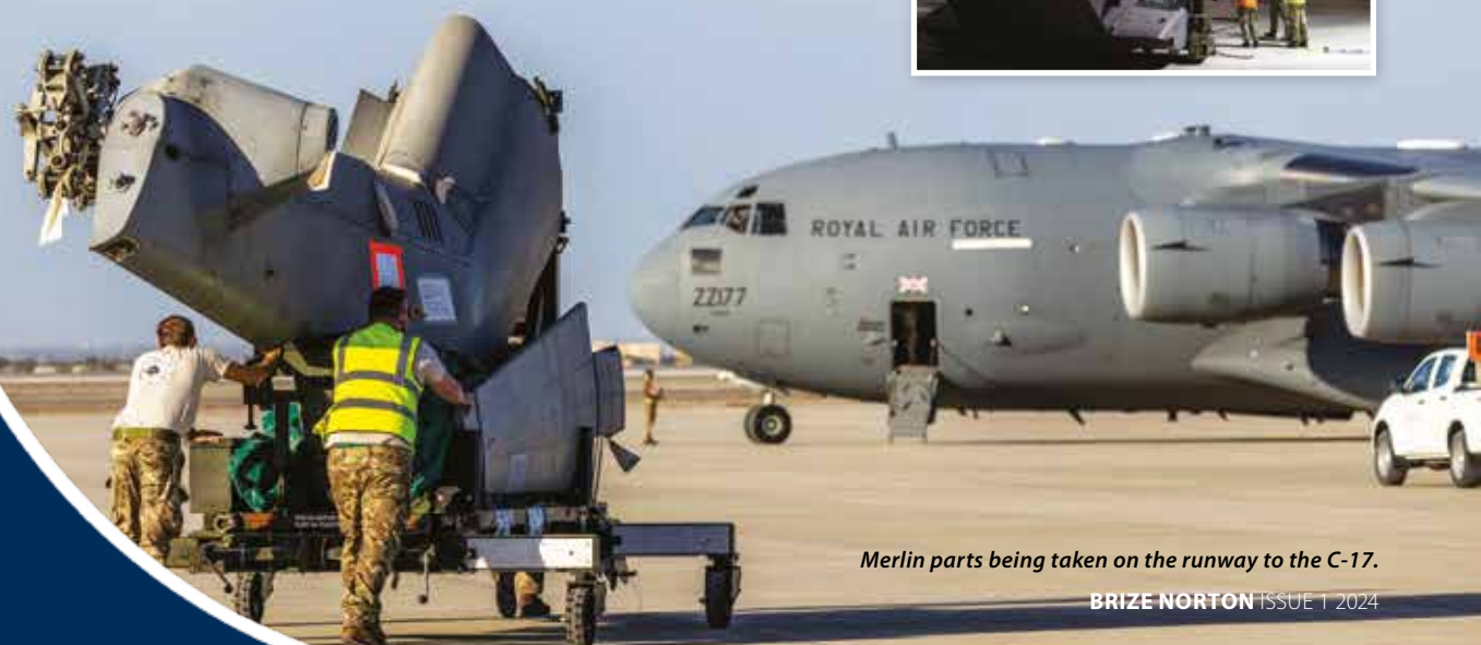
Merlin parts being taken on the runway to the C-17.