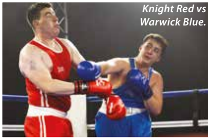
Knight Red vs Warwick Blue.