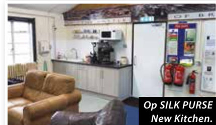
Op SILK PURSE New Kitchen.