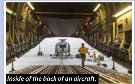
Inside of the back of an aircraft.