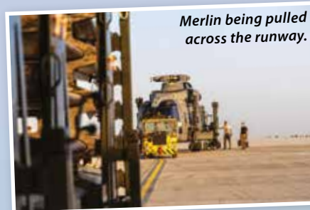
Merlin being pulled across the runway.