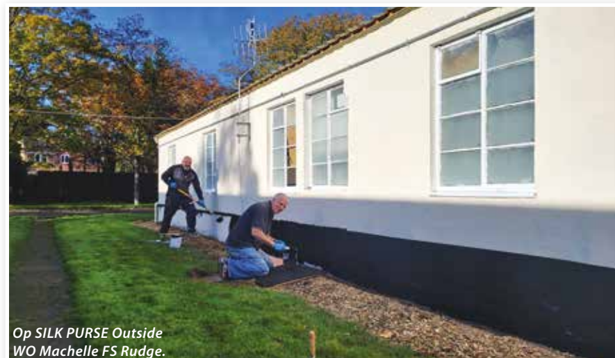
Op SILK PURSE Outside WO Mabelle FS Rudge.