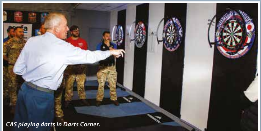
CAS playing darts in Darts Corner.