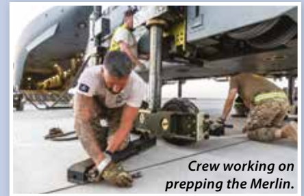
Crew working on prepping the Merlin.

This sortie was just one of several that have returned equipment from all three services that have conducted exercises in the region during the year.