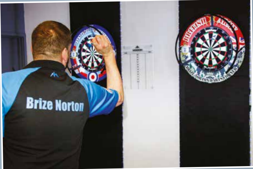
Brize Vs Tidworth.

Although all of the above is fantastic, I think the defining moment for us as a team is hearing people talk about the mental health benefits, a number of people including myself have struggled with mental health recently, getting together with someone over a game of darts allows us to open up and it soon becomes clear that we're not alone and are able to not only get things off of our chest but advise each other as best we can and even help in some cases, it's